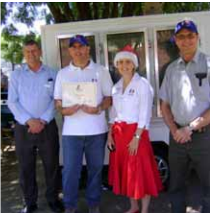
Morialta Trust presentation at Xmas

It has been another very busy year for HeartKids SA, with the focus on the expansion of our support programs, increasing awareness and the building of local fundraising projects. A staggering 70-80% of SA families who require treatment for congenital or acquired heart disease must travel interstate to receive treatment, so the challenge to HeartKids in South Australia is to provide the right support that these families need throughout their life journey with childhood heart disease.