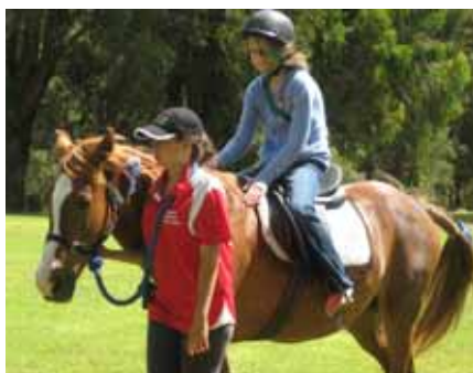
Horse riding at the Family Camp

The strength of HeartKids WA is in family support and the fantastic activities and events that are held throughout the year. The monthly Coffee and Chats, bereavement meetings, and much appreciated pamper days for our amazing Mums provide invaluable support and encouragement. Parents have especially appreciated the Special Condition Coffee and Chats to connect with other parents whose children have the same heart condition and receive input from cardiology staff.