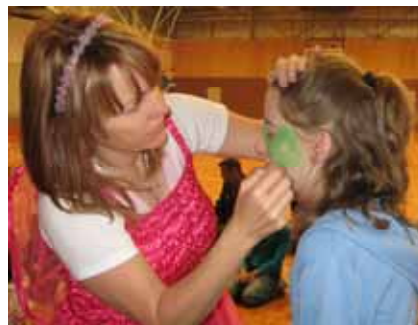
Face painting at Family Camp

We have enjoyed a close working relationship with the cardiology staff at PMH which is essential in providing the highest level of support to our heart kids. We have also been able to help fund PMH nurses to attend Operation Open Heart in Rwanda where 24 heart operations were performed over 5 days. HKWA was able to sponsor four cardiology staff to attend the World Congress of Cardiology in QLD.