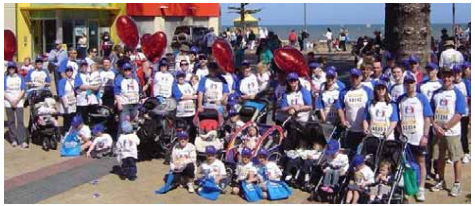
City Bay Group

A second playgroup south of the city was created providing a place for heart kid families to get together. These programs were created and bolstered through the recruitment of volunteers and the deployment of funds raised through our fund raising programs. These programs provide much needed psychological and financial support to heart kids and their families. The challenge for South Australia over the coming 12 months is to expand these services further into other country and rural areas.