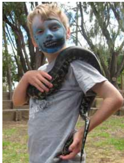
Snakes alive — Family Camp